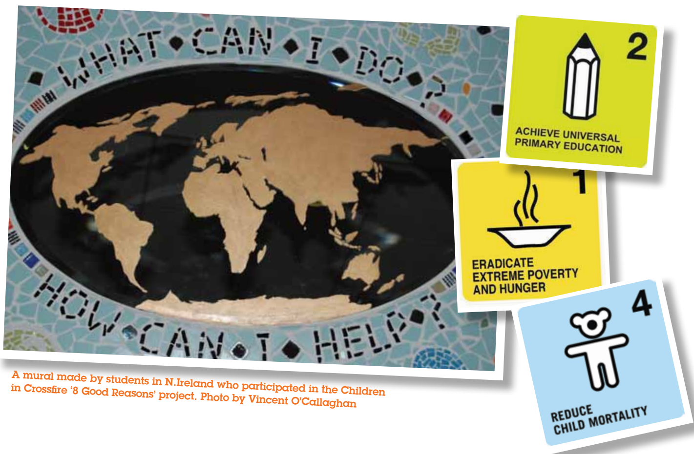
A mural made by students in N.Ireland who participated in the Children in Crossfire '8 Good Reasons' project. Photo by Vincent O'Callaghan