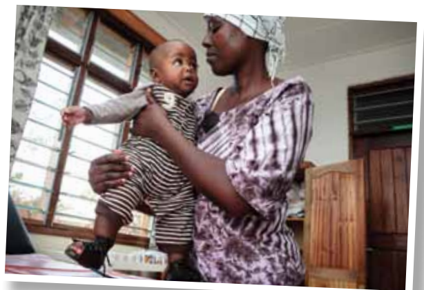
A young child being treated for club-feet in Tanzania.