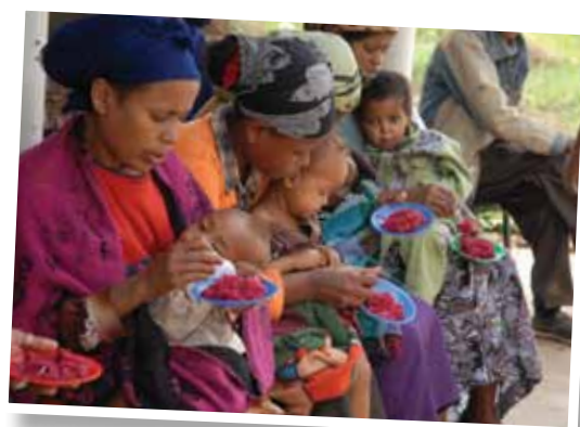
Mothers in Ethiopia feed their young children beetroot porridge made during a good nutrition and cooking demonstration.

When opportunity arises, Children in Crossfire will also respond to needs and challenges in other developing countries where our particular skills and strategic focus can have an impact.