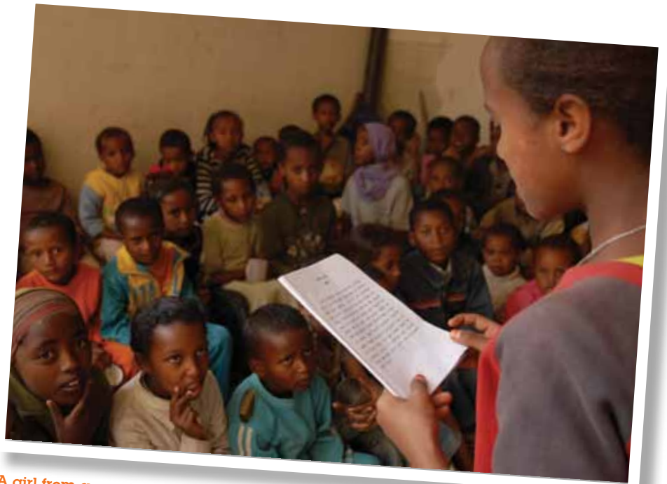
A girl from a re-settled homeless community reads a story to friends while they wait for their daily glass of milk.