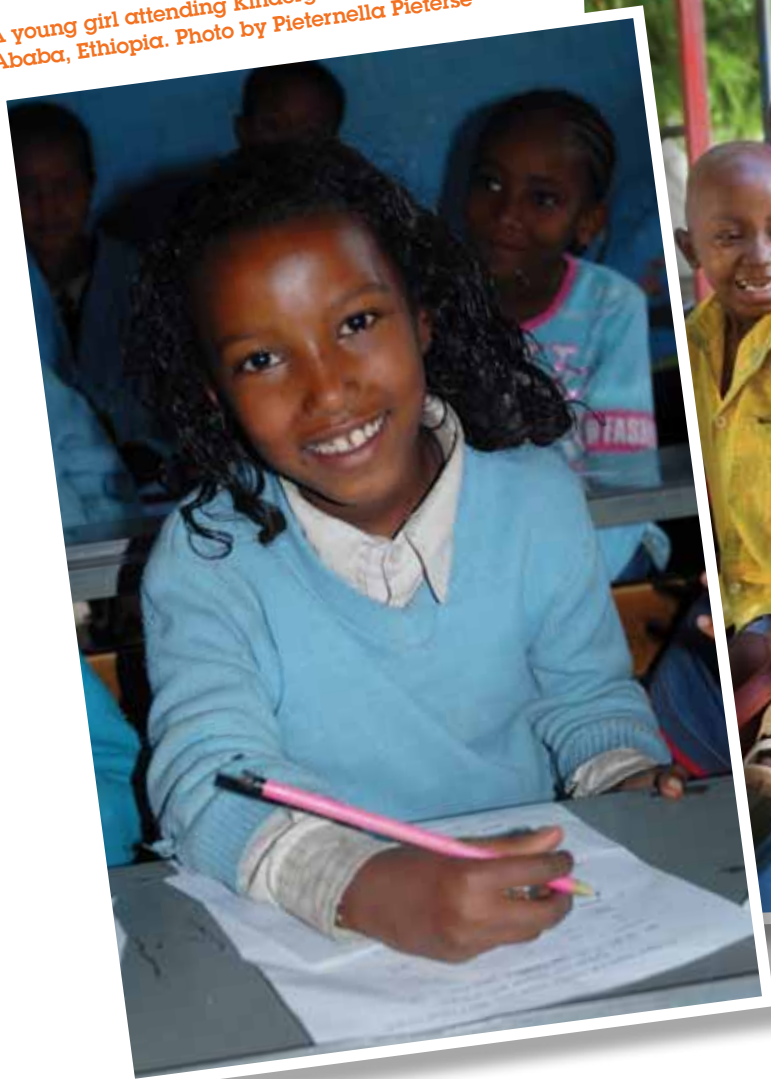
A young girl attending Kindergarden class in Addis Ababa, Ethiopia.

Children in Crossfire comply with the standards stated in the Dóchas 'Irish NGO's Code of Corporate Governance'.